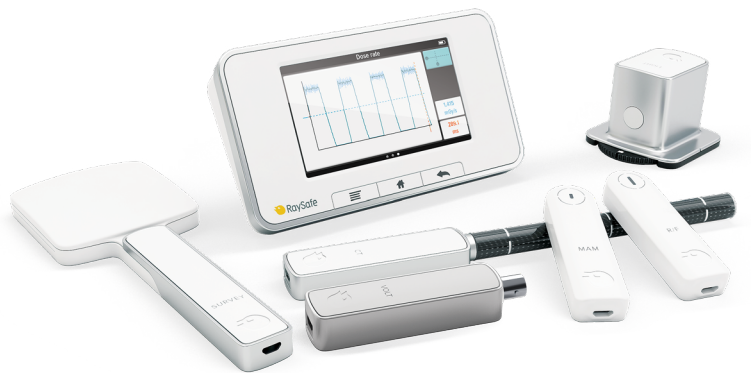
RaySafe X2 System including Base Unit, R/F, MAM, CT, Volt, Light, mAS and Survey sensors.