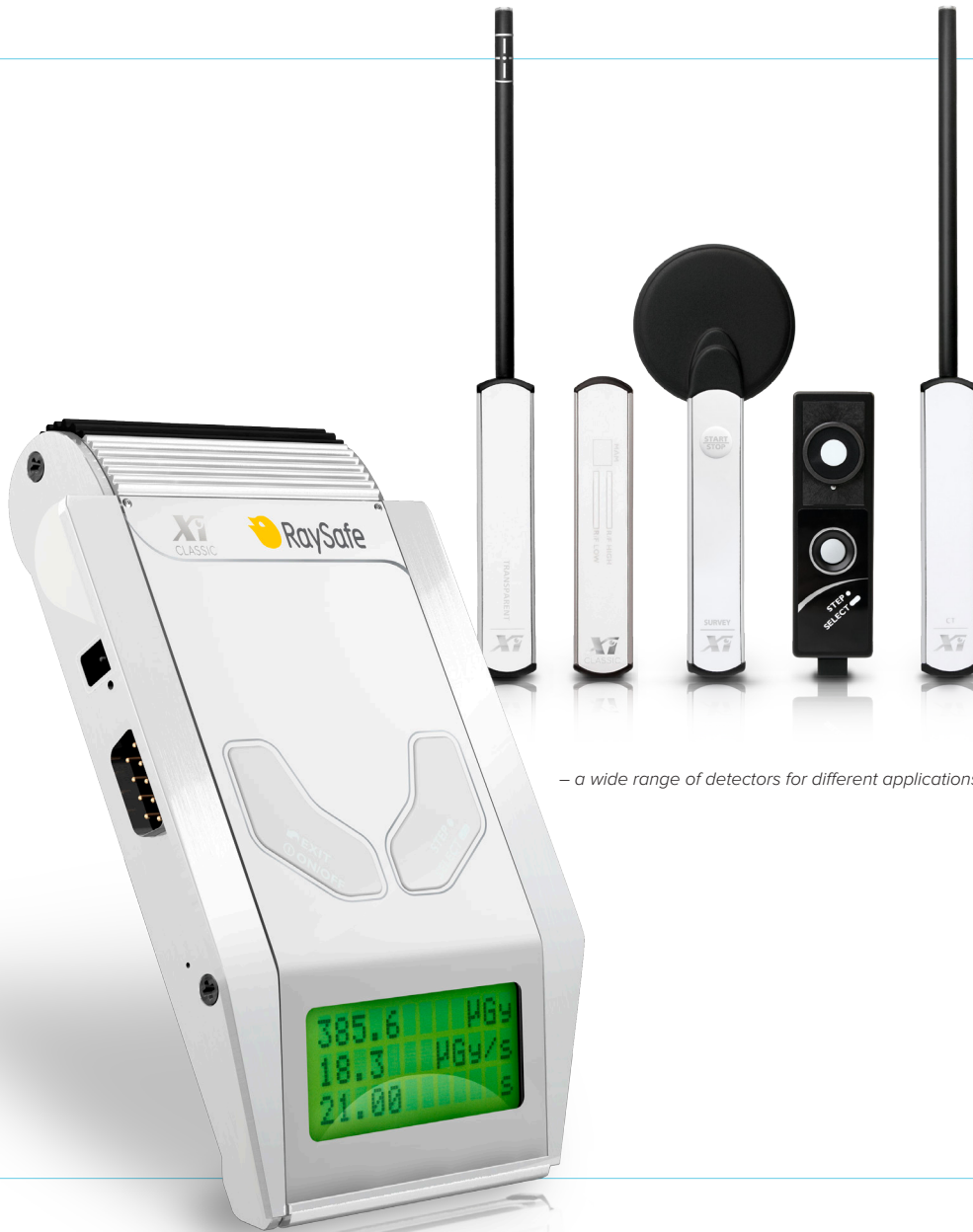
– a wide range of detectors for different applications